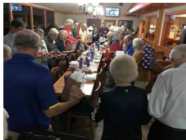
No... we are not praying... We are playing the gift-exchange game

We had so much fun last year, we are doing it again - Bring an aviation related gift from your collection of unwanted, unneeded, or just plain goofy airplane stuff.